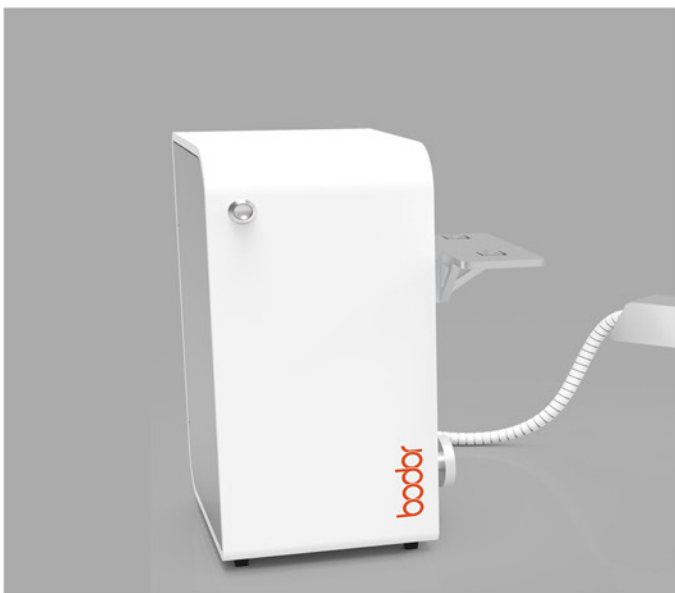
NO.3 START-STOP BUTTON