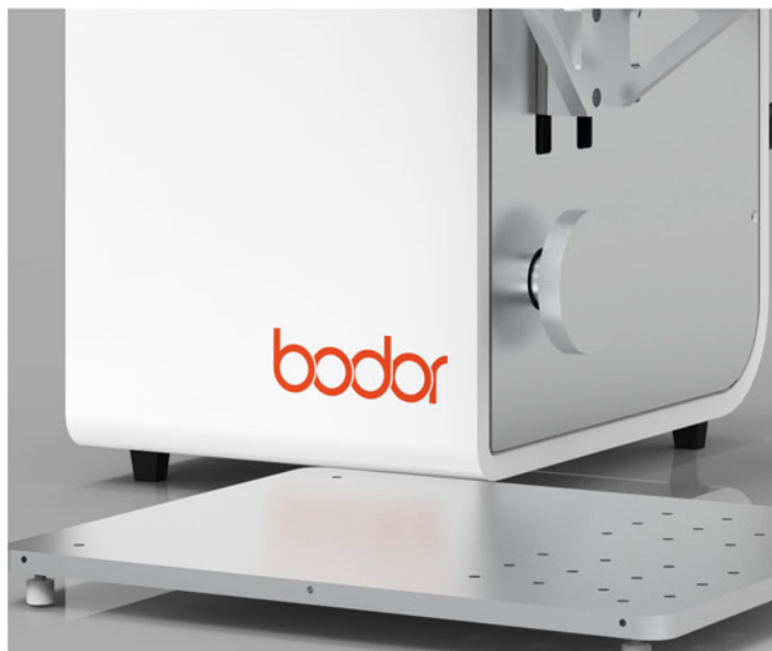
NO.4 SEPARABLE ALUMINUM TABLE