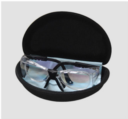
Fiber laser protective goggles