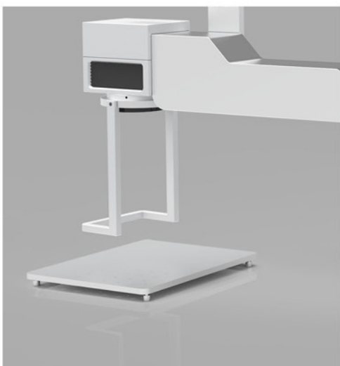
NO.5 MARKING HOLDER