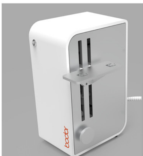
NO.6 LIFTING COLUMN