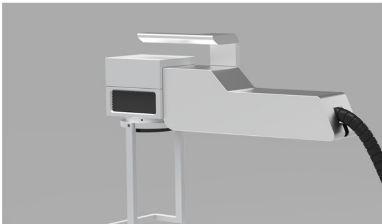
NO.2 HAND HELD TYPE